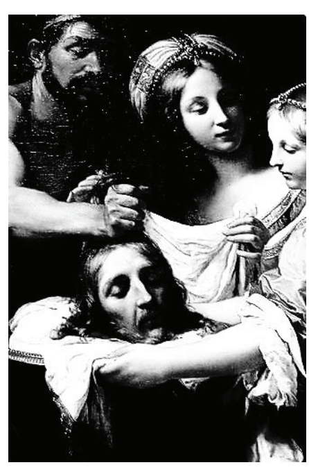
The Passion of St. John the Baptist

And you, fathers, do not provoke your children to anger, but rear them in the discipline and admonition of the Lord. (Ephesians 6:4)